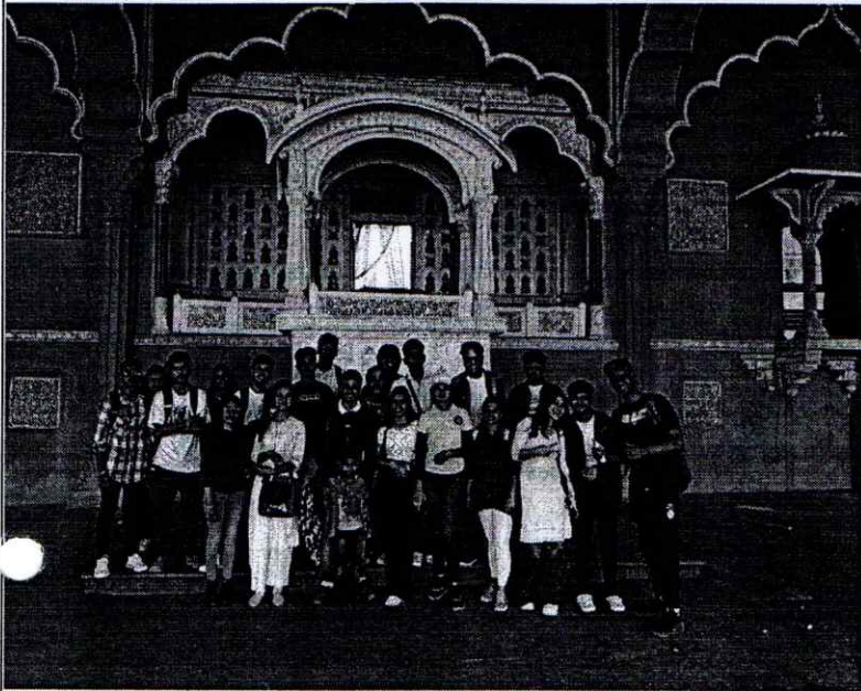
"From Jodha AKBAR Set"